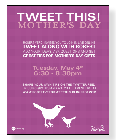
the invite and alert sent out to editors and media guests