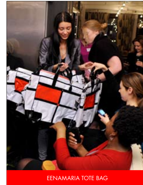
EENAMARIA TOTE BAG