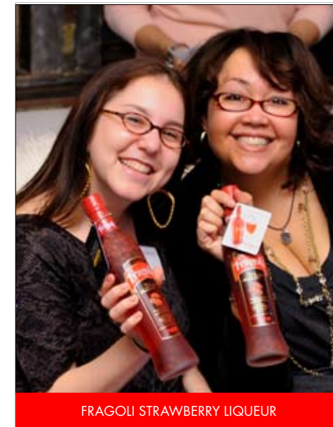
FRAGOLI STRAWBERRY LIQUEUR