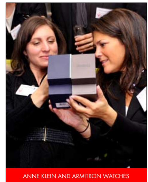
ANNE KLEIN AND ARMITRON WATCHES